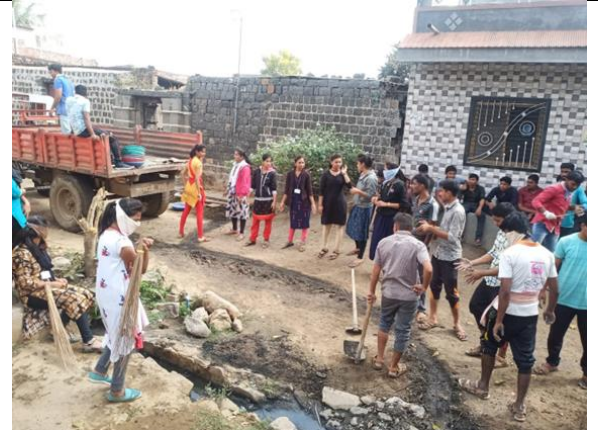
Cleanliness drive in Shirale