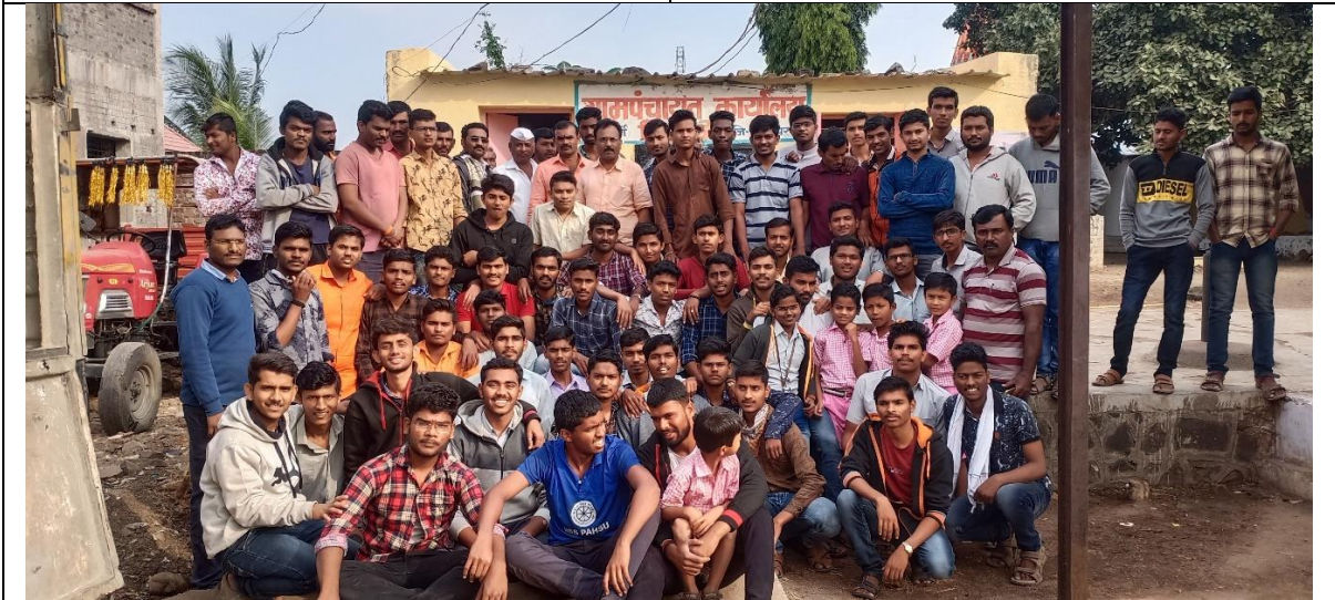
Participated Voluteers in Special Camp at Shirale