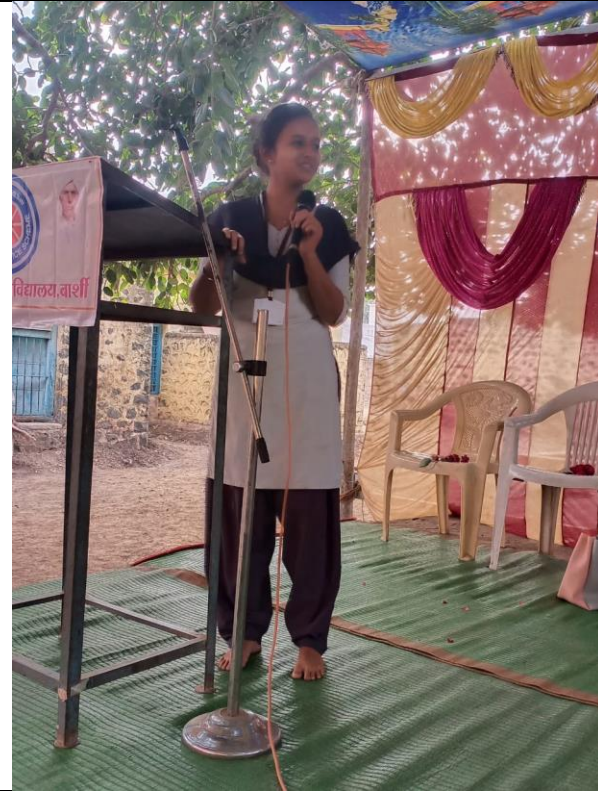
Volunteers creating awareness among the rural people