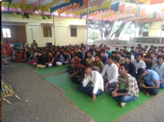
A lecture by eminent Person