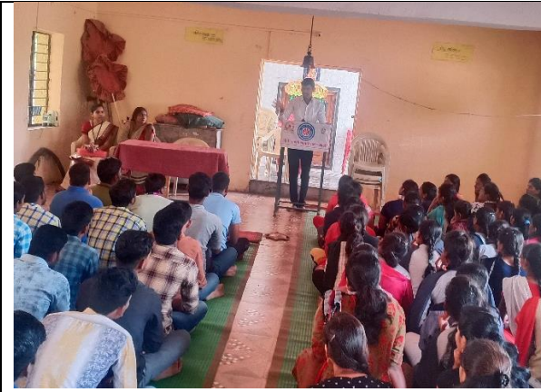
Lecture of Eminent persons

Name of the Department: National Service Scheme