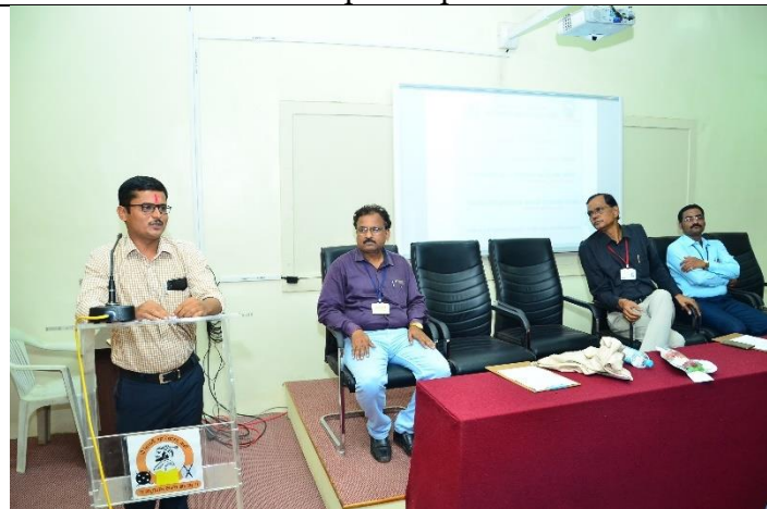
A lecture of Eminent person Gholap Sir