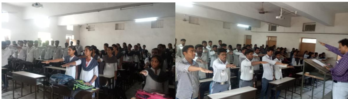
Pledge of Unity