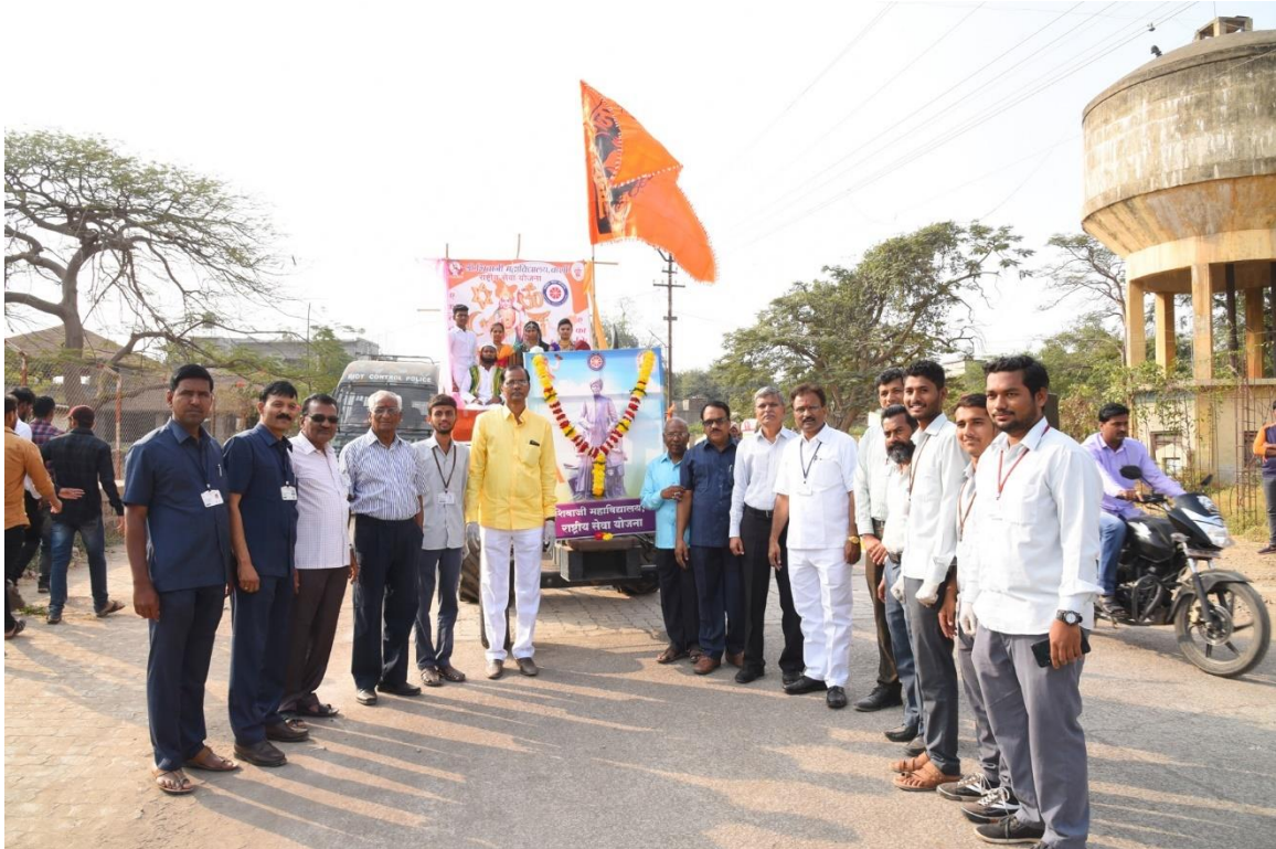
Awareness rally related voter registration and cleanliness