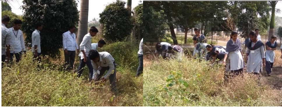
Cleanliness of College campus