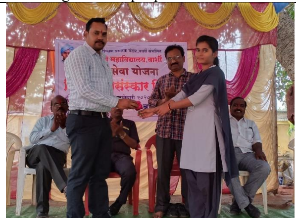
Best Volunteer award to student