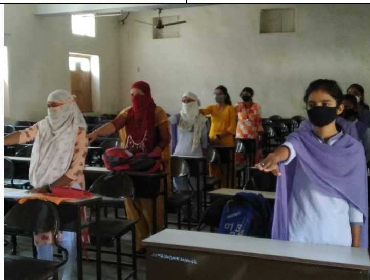
Student taking a pledge of Ekta