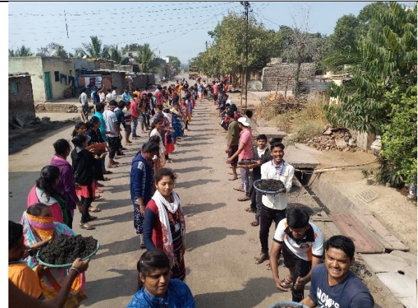
Cleanliness during Camp