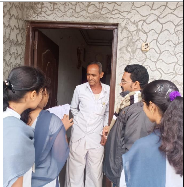
Home Survey made by Volunteer