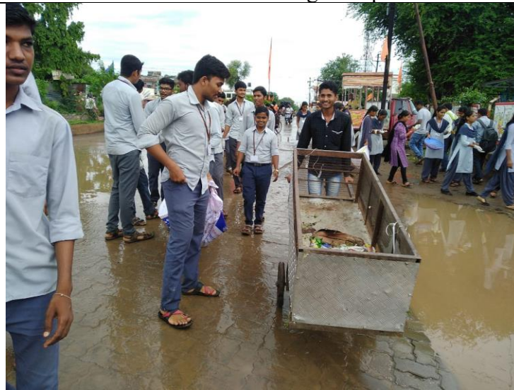
Cleanliness of public place in Barshi