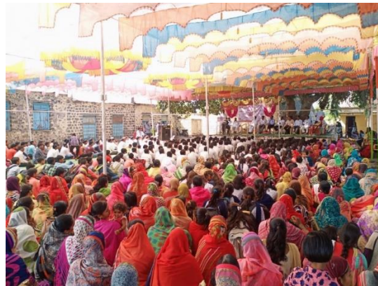
Attendance of people for awareness programme