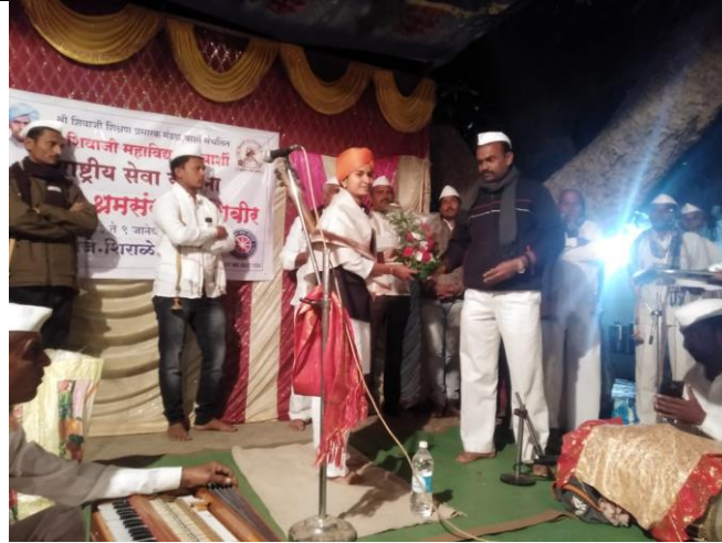
Awareness through Folk Art

Name of the Department: National Service Scheme